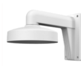
DS-1273ZJ-135 Wall Mount