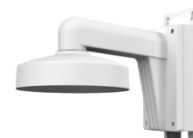
DS-1273ZJ-135B Wall Mount