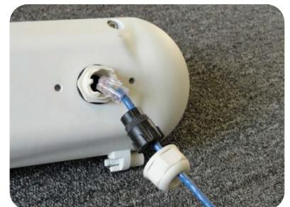
Special M20 Cable Gland